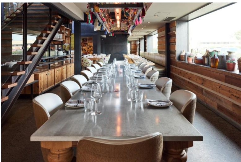
semi-private banquet table semi-private table for parties up to 18 guests