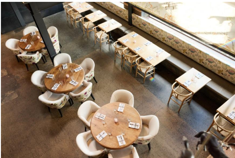
east dining room non-private tables for parties up to 48 guests