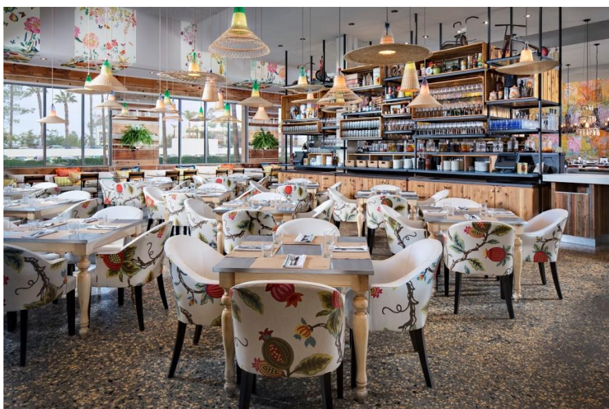
dining room banquette seating (not private) for parties up to 32 guests