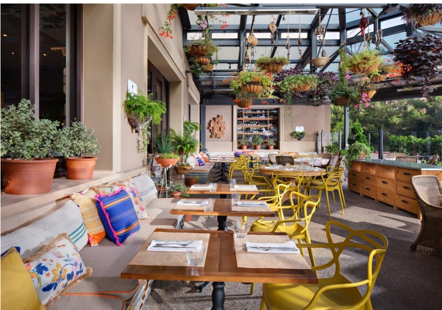
main patio (not private) for parties up to 30 guests