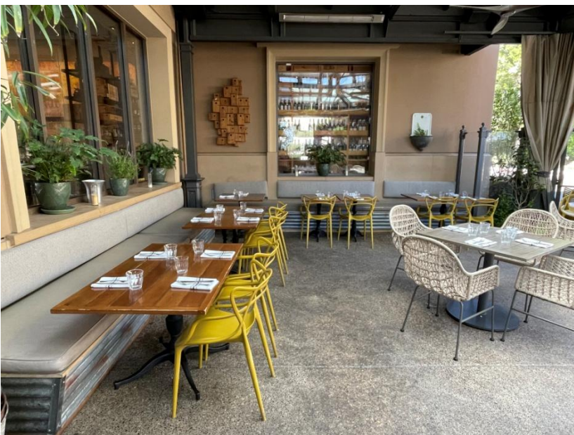
main patio (not private) for parties up to 30 guests