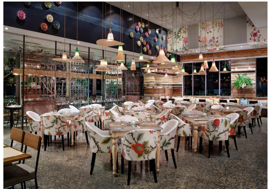
dining room buy out (semi private) for parties up to 100 guests