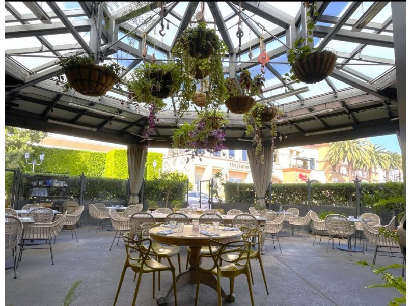
main patio buy out (private) for parties up to 72 guests