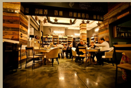
wine shop semi-private tables for parties up to 24 guests